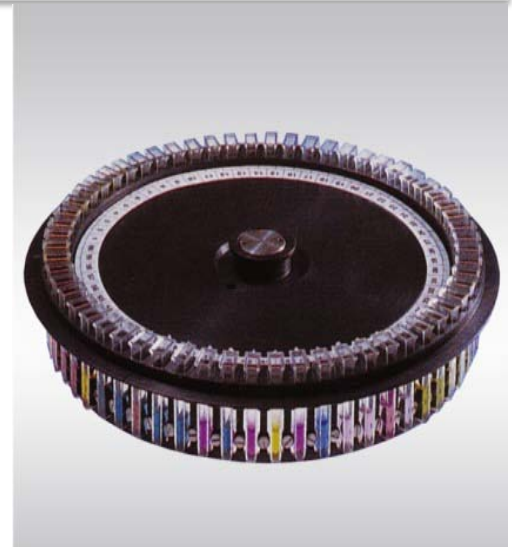
L 330 Reaction wheel with durable cuvettes

The intuitive and simple graphical interface provides immediate system and operation feed-back; like durable cuvette status, test results time toward tests or work-list completion.